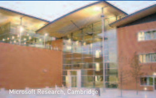
Microsoft Research, Cambridge

The largest and most successful biotech cluster in Europe